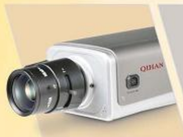
2MP IP camera • H.264 compression • D1 resolution: 1600 x 1200