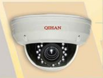
Vandal-proof dome camera • 4-9mm varifocal auto iris lens • 3-axis bracket • IP66-rated