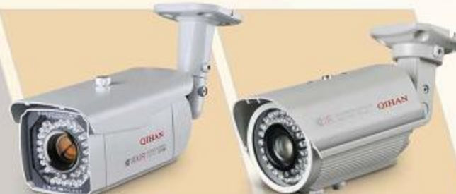
10x zoom IR camera • Sony Super HAD CCD • IP 65-rated • Built-in optical lens, F=3.78-37.8mm