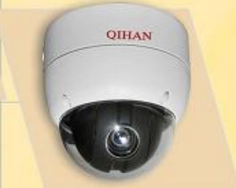
Mini high-speed dome camera • H.264 compression with 704 x 576 D1 resolution • 1/4" interline-transfer CCD • OSD menu with IR day/night function