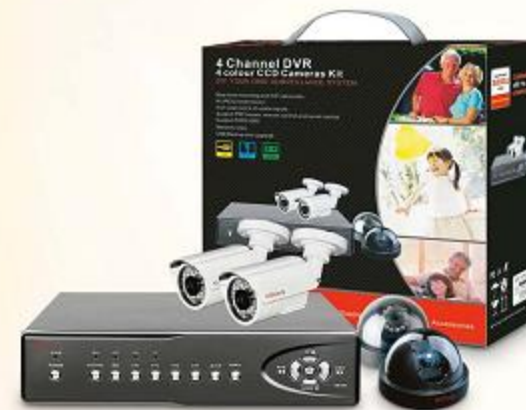
4-color CCD camera kit • Real-time recording and CIF resolution • H.264/M-JPEG compression optional • 4-ch. video and 4-ch. audio inputs • Supports up to 500GB HDD • Support mouse, remote control and panel control • Available with different front panels • VGA network • USB backup and upgrade