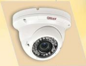
Vandal-proof dome camera • 4-9mm manual varifocal lens • IP 66-rated